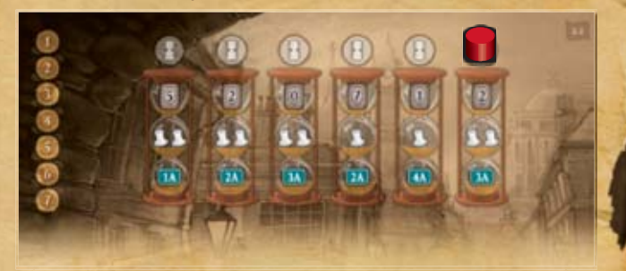
Now it is Yellow's turn. He uses the blue planning marker to block another option and then chooses a plan, with this result:

Green is the starting player for this round. She uses the red planning marker to block one of the options: