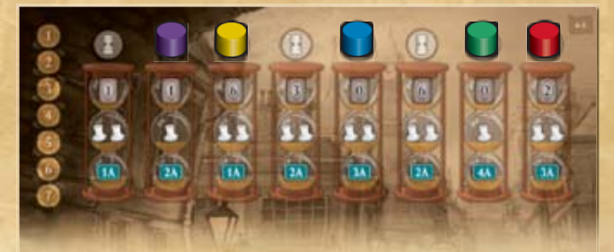
Each player drew his or her cards immediately after choosing a plan. For the remaining phases of this round, players will play in this order: Purple, Yellow, Blue, Green, Red.

At the end of the planning phase, the board looks like this: