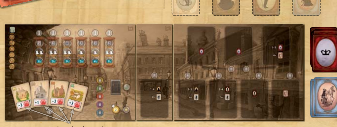
property tokens placed at random