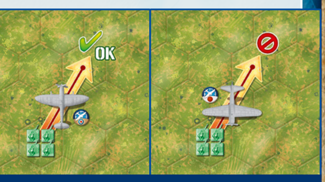
This infantru unit may move under the cover of their aircraft... but they may not move through a hex occupied by an enemy air unit.