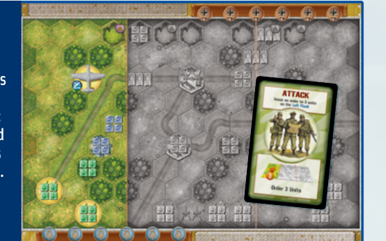
That player now plays an Attack Left card to order three units: two ground units and the air unit that was previously deployed.

If you want to enhance the air unit capabilities, then you can play a matching Air Combat card along side your Command card to apply the card's special effects instead of your standard attack run.