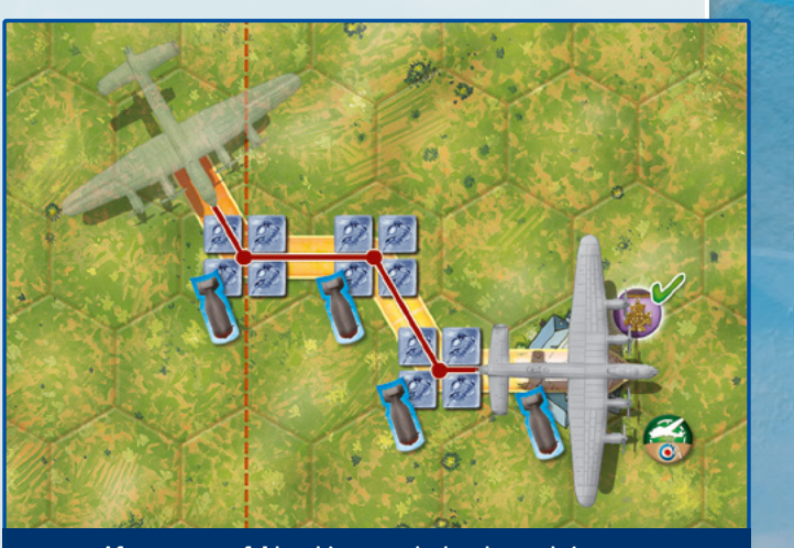
After a successful bombing run, the bomber ends its move above the town and declares a strategic bombing.

Resolve the bomb token during the Battle phase, after any attack run and dogfight, if any. If a grenade is rolled, claim the medal on the objective hex.