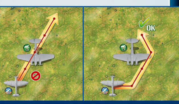
The enemy air unit blocks the way!