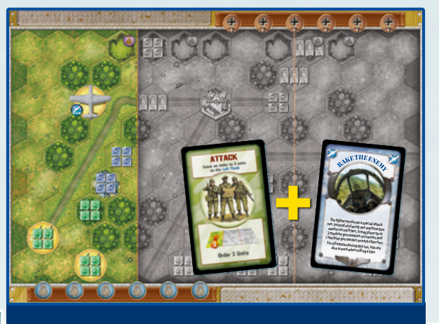
The player could have played a Rake the Enemy Air Combat card alongside the Command card to allow their fighter to use the card's special action instead of its normal battle action.

If an air unit does not receive an order, it remains on the battlefield as any other unit would. The pilot is simply patrolling the area, waiting for new orders.