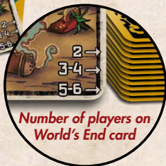
Number of players on World's End card