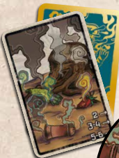
World's End card