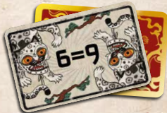
SPICE IT UP cards