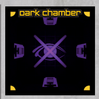
"Wonderful, a dark chamber! Perfect for developing your sense of touch... if you have time!"

While in this room you can only program one action during the Programming phase.