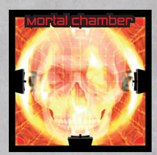
"My favorite one! No season 2 for you!"

When you enter this room, you are instantly killed.