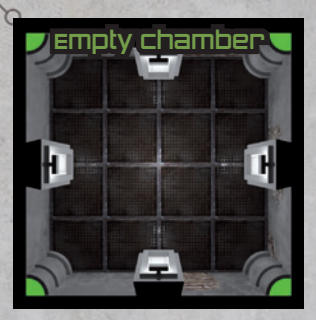
"Awesome, an empty room! Enjoy the break!"