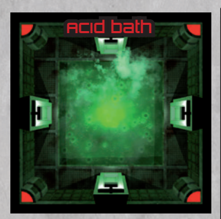
"An acid bath! Alone it's awesome, but it's even better to share it!"

As soon as you enter, this room locks itself from the inside and becomes inaccessible (no one can enter for the rest of the game). After your second action of the next turn, if your character is still there, you drown.