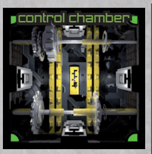
"Terrific! Mechanisms and controllers! You look handsome with your hands all dirty!"

Place your character in this room after revealing it. Then, take the room with your figurine and exchange it with any hidden room on the board. The hidden room stays hidden. If all the rooms are already revealed, this room has no effect.