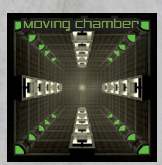
"Watch out it's shaking! And it's going to move!"

You have to leave this room with your next action or you're executed.