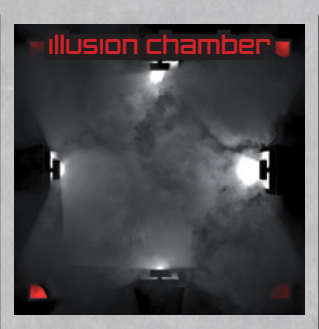
"Great! The room of your dreams, or at least, that's what it claims to be..."

You can only leave this room by moving onto a character located on room adjacent to yours OR by moving onto the Central room, if it's adjacent to the Prison room when you want to leave it.