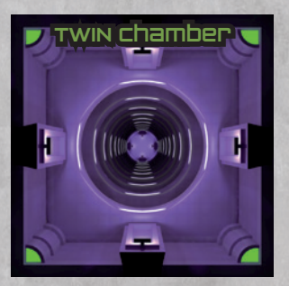
"Great! Awesome! A molecular transporter... But, will it work?"

Slide any line of the board (except the central ones) in the direction of your choice. Slide all the rooms one rank following the same process as for the Control action (see Actions - Control).