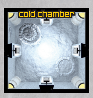
"What I prefer in the cold chamber is the temperature! Am I right?!"

As soon as two characters are in this room, the one who entered earlier is eliminated by the arrival of the second one.