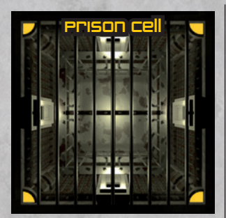
"A cell locked from the outside... I hope you have friends around!"

When you enter this room, you are instantly killed.