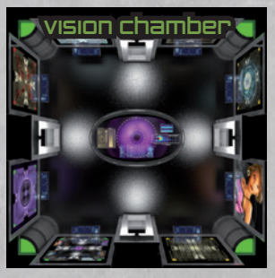
"Video screens, excellent! A good time to place your token!"

Take your character figurine and place it on the Central room.