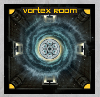
"Back to square one! Hurry up!"

Exit room. When all the prisoners have entered this room, one of them has to move it out of the Complex using the Control action.