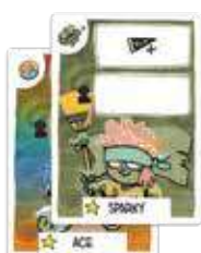
Example Setup for Two Players