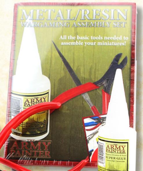
METAL/RESIN ASSEMBLY SET