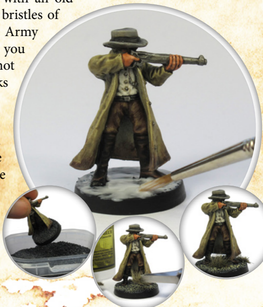
Black Scorpion Miniatures

The Battlefields Basing Glue is water based and non-toxic and can be cleaned of with water before drying. After drying excess glue can be scraped off but may stain table or cloth.