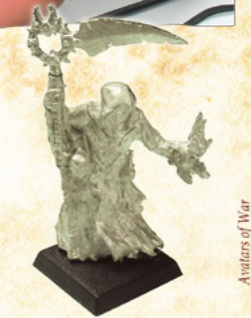
Ancestors of War