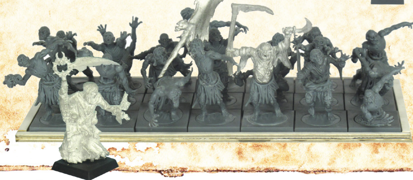
Ancestors of war and Marik games