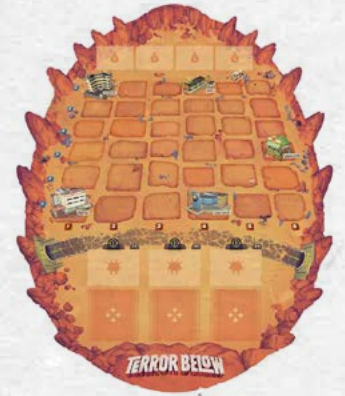
1 Game Board