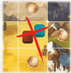
This is not allowed.

IMPORTANT: A square on a land card may never contain more than one marker.