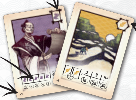
End-of-game conditions and scoring points