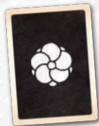
First Player card (recto verso)